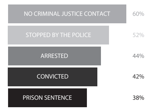
Figure 9.1. Voter participation rates decrease with severity of criminal police contact. Source : Data courtesy of National Longitudinal Study of Adolescent Health, Black Youth Culture Survey, and Fragile Families and Child Wellbeing Survey. Based on a chart published in Boston Review by Weaver, Vesla (2014).

Voter participation rates decrease with severity of criminal justice contact.