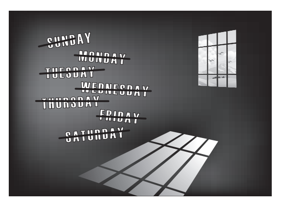
Figure 1. The prisoner eliminates all possible days.

still be alive and you would know with absolute certainty that the hanging would be on Saturday. You would know this before you were told so on Saturday morning. That would violate the judge's decree."