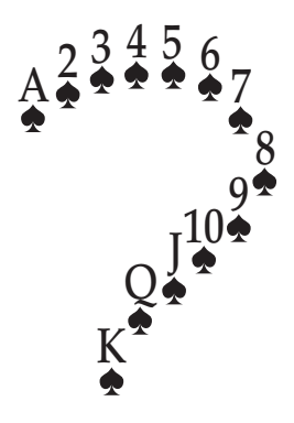
Figure 3. The paradox of the unexpected spade.

Assuming that your friend plans not to lose money, is it possible that the king of spades was placed on the table? Obviously not. After you have named the first 12 spades, only the king will remain. You will be able to deduce the card's identity with complete confidence. Can it be the queen? No, because after you have named the jack only the king and queen remain. It cannot be the king, so it must be the queen. Again, your correct deduction would win you $1,000. The same reasoning rules out all the remaining cards. Regardless of what card it is, you should be able to deduce its name in advance. The logic seems airtight. Yet it is equally obvious, as you stare at the back of the card, that you have not the foggiest notion which spade it is!